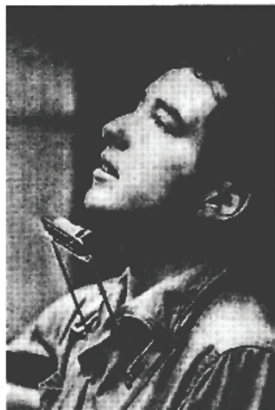
Ukulele Club of Santa Cruz / Big Sur Campout September 2003