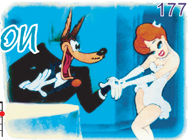
Ukulele Club of Santa Cruz "Love Songs" February 2005