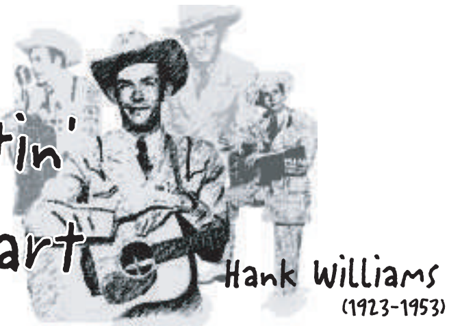
Hank Williams (1923-1953)

Original recording: Castle Studio, Nashville, Tennessee, Sep 23, 1952