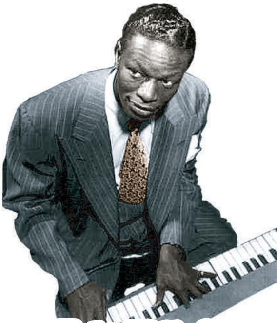
NAT KING COLE 1919-1965