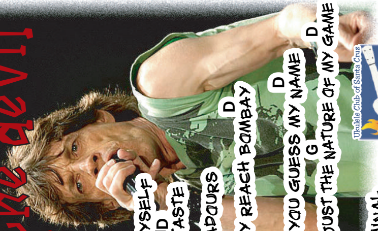
Ultimate Club of Santa Cruz September 22-24, 2006

C SO IF YOU MEET ME, HAVE SOME COURTESY D HAVE SOME SYMPATHY AND SOME TASTE C USE ALL YOUR WELL-LEARNED POLITESSE D OR I'LL LAY YOUR SOUL TO WASTE A PLEASED TO MEET YOU, HOPE YOU GUESS MY NAME D BUT WHAT'S PUZZLING YOU, IS THE NATURE OF MY GAME