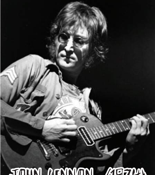
JOHN LENNON (1974)