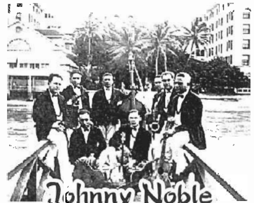
Johnny Noble and his Band Members on the Ala Moana Pier on Waikiki Beach

C I only live in memory D7 Of all the things I used to do G7 Back on the shores of Waikiki C (G7 to return to CHORUS) In a canoe