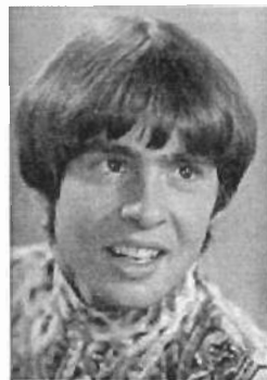
Davy Jones RIP 1945-2012

At the start, the four actors provided vocals for the songs played during the television episodes and released as records (supervised by legendary producer Don Kirshner), but were otherwise given extremely limited performance opportunities.