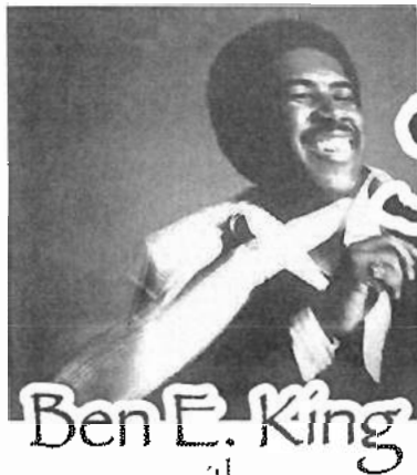
Ben E. King with Jerry Leiber & Mike Stoller 1960

Jerry Leiber (b. 1933) and Mike Stoller (b. 1933) are among the most influential American songwriters and music producers of popular music. In the 1950s they created a string of hits that include "Hound Dog", "Kansas City", "Smokey Joe's Cafe", "Riot in Cell Block #9", and "Jailhouse Rock."