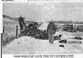
PLANE CRASH THAT KILLED THREE TOP RECORDING STARS

MARION CITY, Iowa (AP)—Three rock 'n' roll singing idols whose records and appearances drew millions of fans a night, were killed early yesterday in a wild, snow-swept Iowa field. The four planes were carrying the idols and their fans, while another plane fell out of sight soon after the Marion City airport.