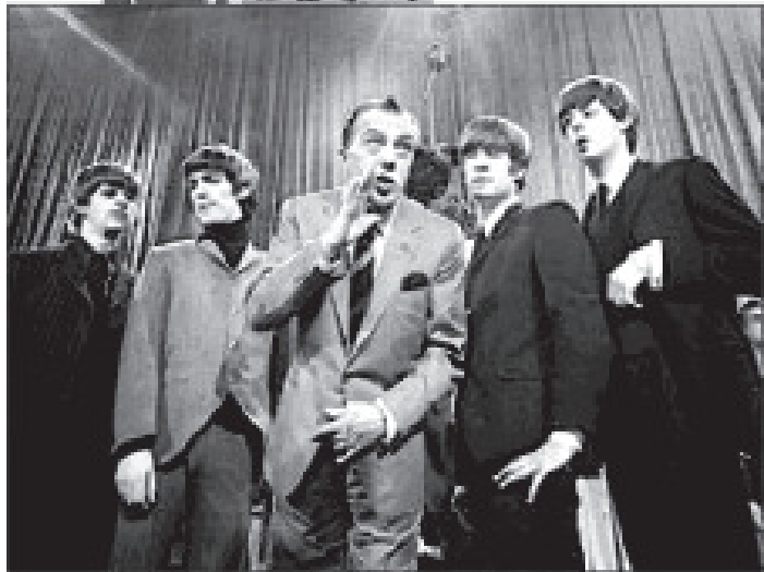
"Nice lads of course---as we are always being reminded ---in spite of their fans, their clothes and their haircuts" Ed Sullivan