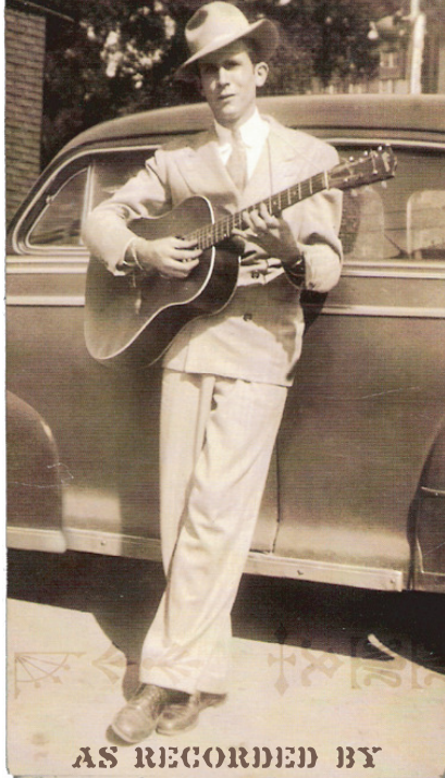
AS RECORDED BY HANK WILLIAMS 1948

Words and music by Irving Mills and Cliff Friend Emmett Miller's 1928 version of "Lovesick Blues" became "the direct inspiration for the 1948 performance that 25-year-old Hank Williams rode to fame."