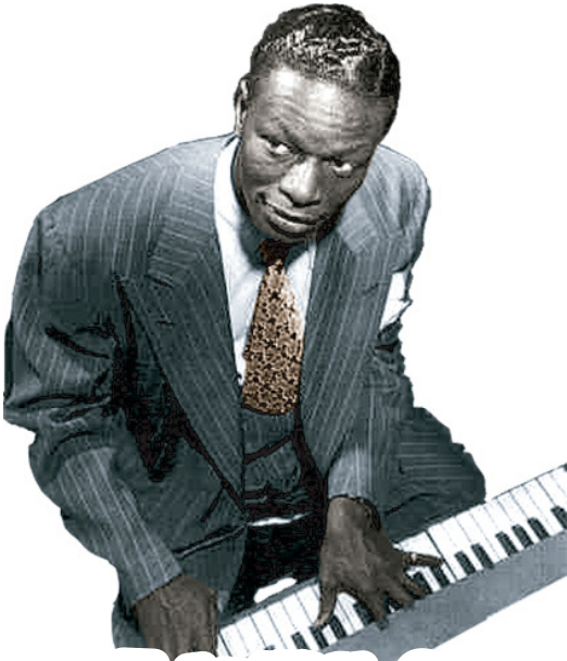
NAT KING COLE 1919-1965