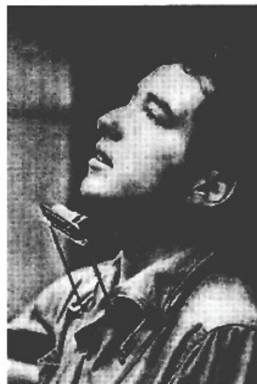
Ukulele Club of Santa Cruz / Big Sur Campout September 2003