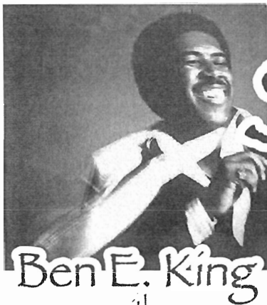
Ben E. King