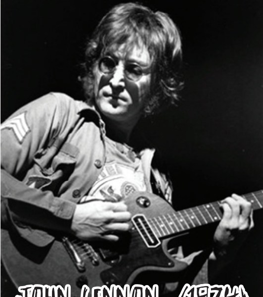
JOHN LENNON (1974)